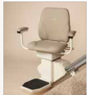
Pinnacle Heavy Duty