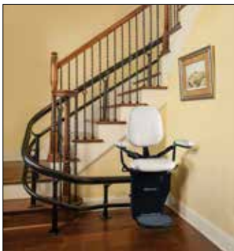
Curved Stair Lifts