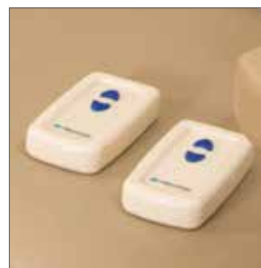
Two wireless remotes standard.