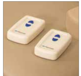
Two easy to use wireless remotes included