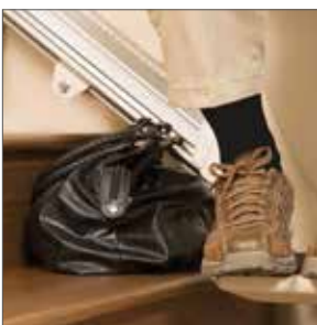
Safety sensors on chassis and footrest instantly stop the lift at any obstacle.