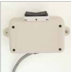
Wall mounted call/send controls