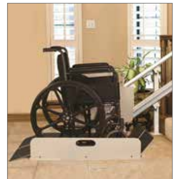
Incline Platform Lifts