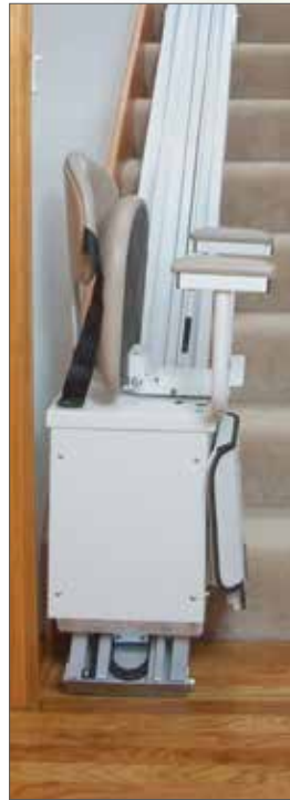
14" width when folded