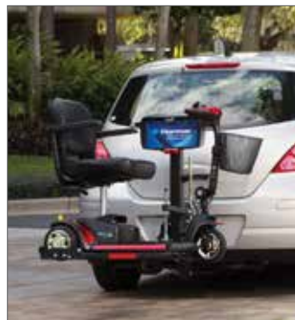
Multiple auto lift solutions for wheelchair or scooter