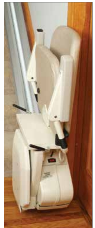
Narrowest lift on the market, fits in tight stairwells and makes it easy for others to pass.