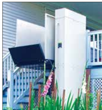
Vertical Platform Lifts