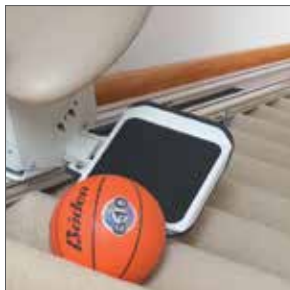
Safety sensors on footrest