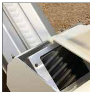
Patented helical worm gear, requires no messy greases to maintain a smooth ride.