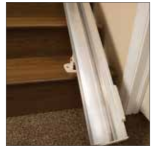
Covered gear rack keeps your stairs clean