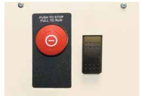
Easy to use rocker switch with emergency stop.