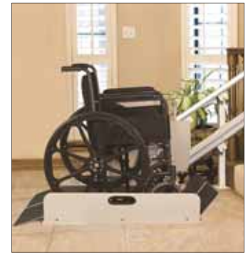
Incline Platform Lifts