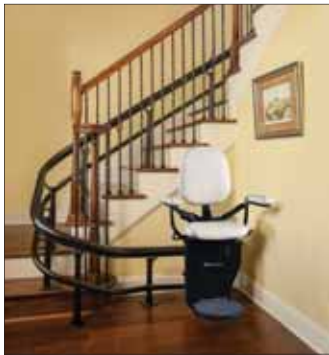
Curved and Straight Stair Lifts