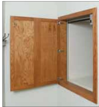
Dumbwaiters and Cargo Lifts