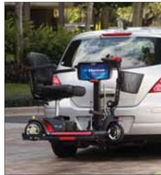
Multiple auto lift solutions for chair or scooter